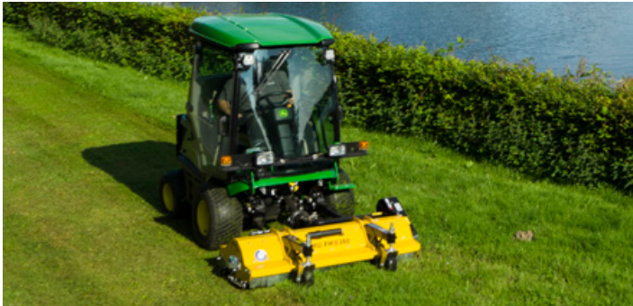
Müthing MU-FM VARIO Front with 2-point linkage