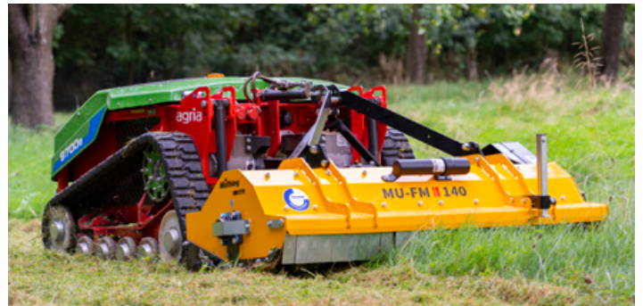
Müthing MU-FM VARIO Front with 3-point linkage, Cat. 1