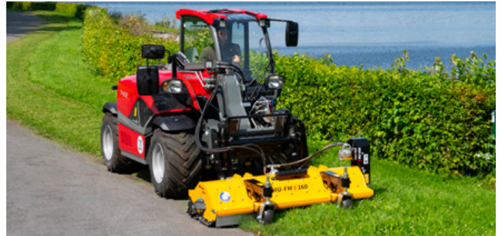
Müthing MU-FM VARIO Front with hydraulic drive