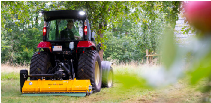
Müthing MU-FM VARIO Rear with 3-point linkage, Cat. 1